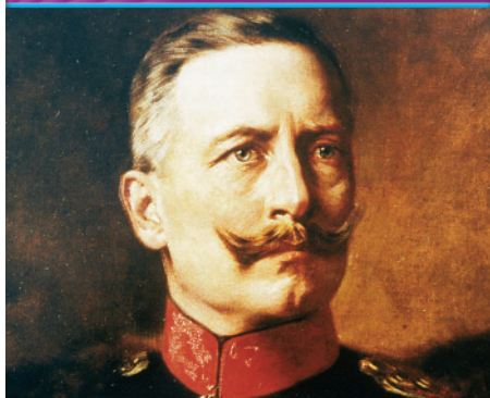
Kaiser Wilhelm II 1859–1941

Wilhelm II was related to the leaders of two nations he eventually would engage in war. Wilhelm, George V of Great Britain, and Nicholas II of Russia were all cousins.